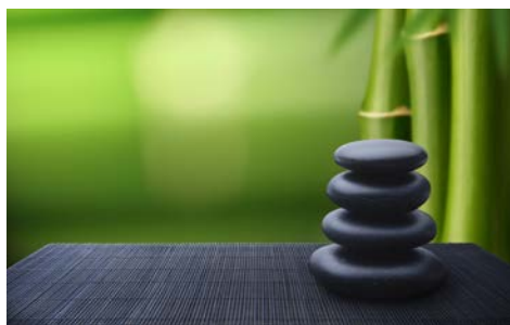
Celebrate the Moment