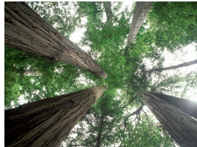
Prepare for the Future